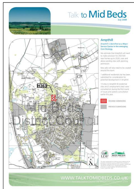
Figure 2 - Round two consultation sites