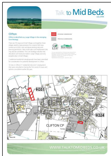
Figure 2 - Round two consultation sites

Public response - From the Talk to Mid Beds website going live in February 2008 there were 1415 visits to the Clifton parish pages (up to end of 22 nd September 2008) while 15 postal packs were distributed during the two rounds of consultation.