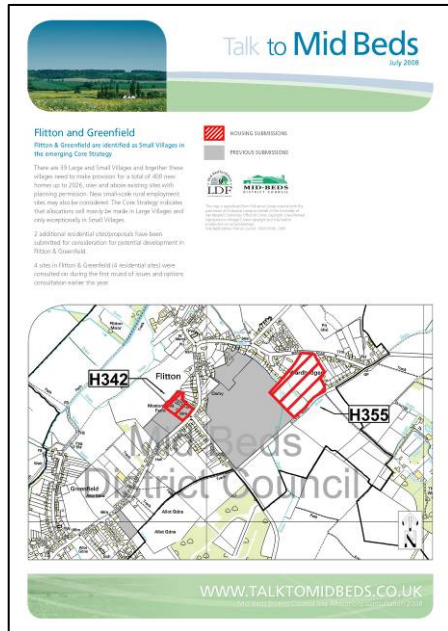
Figure 2 - Round two consultation sites

Public response - From the Talk to Mid Beds website going live in February 2008 there were 919 visits to the Flitton and Greenfield parish pages (up to end of 22 nd September 2008) while 12 postal packs were distributed during the two rounds of consultation.