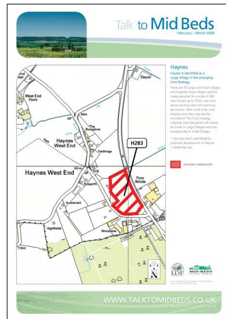
Figure 1 - Round one consultation site

A public exhibition of these sites was held at the Maulden Church Hall, Church Road, Maulden on Friday 11th July 2008, between 2.00pm and 8pm.